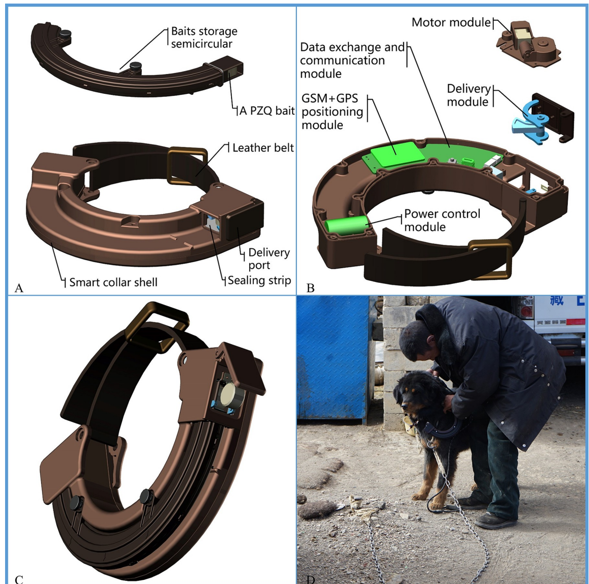
Fig 1. Development and field tests of smart deworming collar (A: 3D stacked graph of smart collar; B: Embedded modules for smart collar; C: Overall shape of Smart collar; D: Recovery of collars in July 2019 in Seni district after they had been attached for a year).

The initial design of the deworming device was performed from September 2016 to December 2017, and its 3D model (Fig 1A) was constructed. The required modules, including PZQ delivery, data exchange and communication, power control, GSM+GPS, and motor, were designed on the basis of IoT (Fig 1B)[24]. We optimised and upgraded it (Outer diameter:224mm, Inner diameter: 131mm, Thickness: 39mm, Weight: 400g including 12 PZQ baits; Fig 1C) from January 2018 to June 2019. The smart deworming device can deliver PZQ baits for dogs automatically, regularly, quantitatively with predominant characteristics of being waterproof, anti-collision, and cold-proof to ensure it runs well in the harsh climate[25]. A series of tests were also conducted for the production process, to assess performance, functionality, and data exchange, using a remote management system (RMS, a platform specially developed for